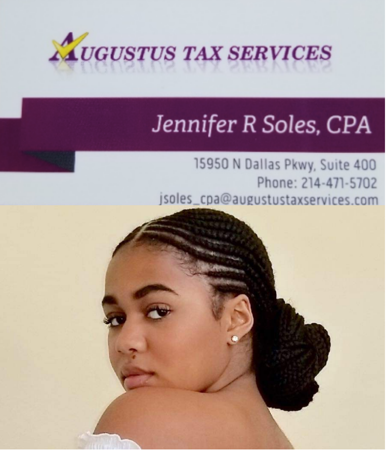
Tiffany Brandwise consulting